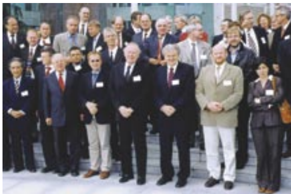
Participants in the launch meeting of the EMF

This poses new challenges to the broad-based, interdisciplinary, materials science and technology community which, although of crucial importance to European competitiveness in many industrial sectors, tends to be fragmented and in need of coordination. Thus emerged the concept of a European Materials Forum to represent the knowledge base of Euro-