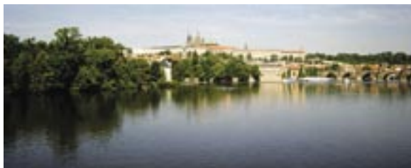
Prague - Venue for EUROMAT 2005

Preliminary details are available on the website: www.euromat.fems.org