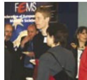
The FEMS Stand