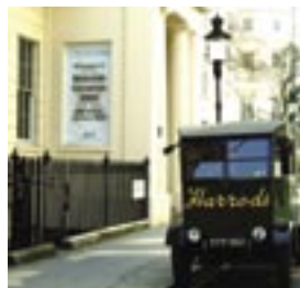
Carlton House Terrace