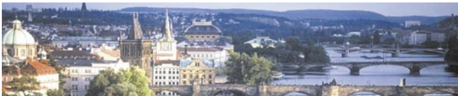
Bridges over the River Vltava in Prague

We are delighted to announce that more than 1700 abstracts have been received to date for EUROMAT 2005 from authors in 57 different countries.