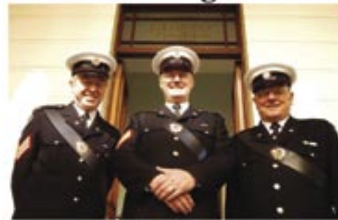
Number 1, Carlton House Terrace

The Institute of Materials, Minerals and Mining has announced the dates for its 5 th Materials Congress, which will be held in London on 5-7 April 2006. The event will again take place in and around its HQ in Carlton House Terrace.